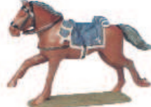
PA546B Officers Horse for PA546A