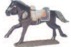
PA546C Troopers horse for PA546A