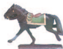
PA548B Officers horse for PA548A