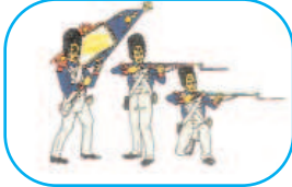
PA539 France: Imperial Guard Grenadiers II