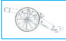
PA518 France: 8 & 12 pounder cannon.