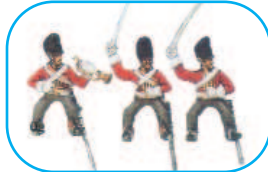
PA544 British: Scots Grey