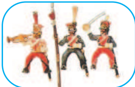
PA547A Polish Lancers