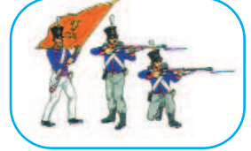
PA542 Netherlands: 36th Chasseurs