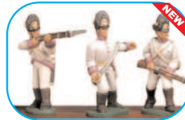
PA550 Austrian: Officer Advancing & Firing