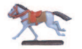
PA543C Officers Horse for PA543A & PA544