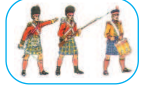
PA534 Britain: 42nd Highlanders