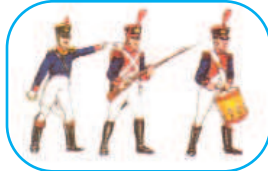
PA532 France: Grenadiers Line Infantry