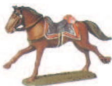
PA547B Horse for PA547A