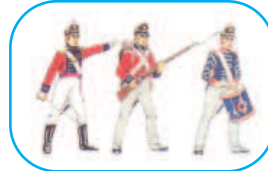
PA533 Britain: 1st Foot Guards