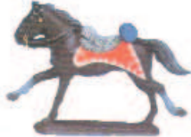
PA545C Troopers Horse for PA545A