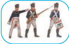
PA535 Prussia: Guard Infantry