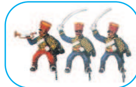
PA545A British: 10th Hussars