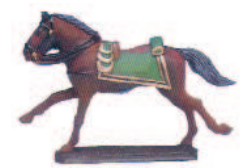
PA548C Horse for PA548A

PA519 France: Line artillery man & Line artillery corporal (not illustrated)