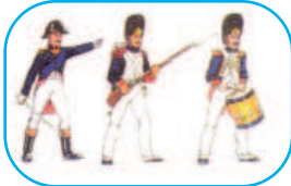
PA531 France: Imperial Guard Grenadiers