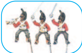
PA543A 6th Inniskillin Dragoons