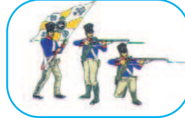
PA541 Prussia: Guard Infantry II