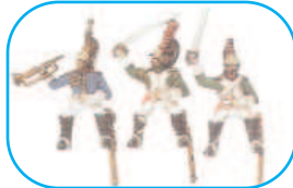
PA548A France: Empress Dragoons