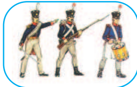
PA536 Netherlands: Foot Chasseurs