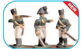
PA551 Russian: Officer Advancing & Firing