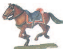
PA547C Horse for PA547A