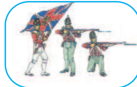
PA537 Britain: Foot Guards