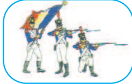
PA540 France: Grenadiers Line Infantry II