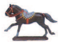
PA543B Officers horse for PA543A & PA544