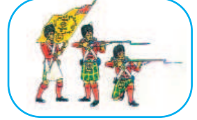
PA538 Britain: 42nd Highlanders II