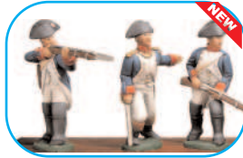
PA549 French: Officer Advancing & Firing