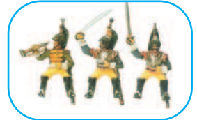
PA546A France: Currassiers