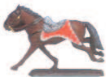
PA545B Officers horse for PA545A